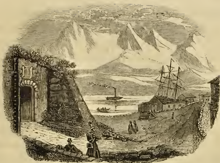
VIEW OF THE BAY OF SOUCHOM-KALE.